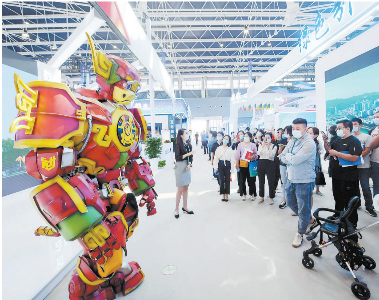
Visitors watching an intelligent robot at the 2021 China International Digital Economy Expo.

For example, at the newly concluded World Internet Conference Wuzhen Summit, 40 projects on digital economic cooperation were signed, with total investment of over 60 billion RMB.