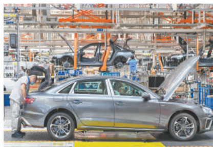
A worker is assembling a car in the workshop of FAW-Volkswagen Automobile in Changchun, Jilin Province, northeast China, April 2, 2021.