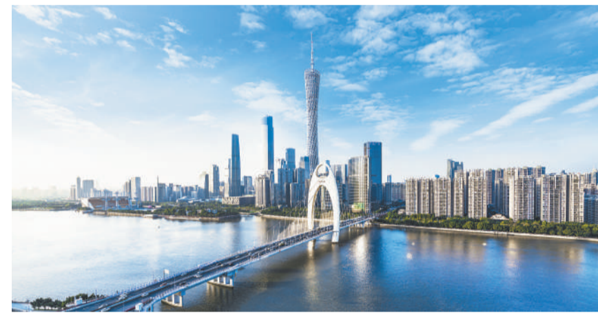
Canton Tower, at the south bank of the Pearl River, is the landmark of Guangzhou city.