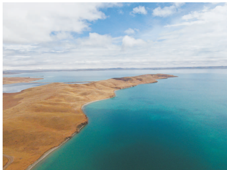
Aerial photo taken on May 25, 2021 shows a view of Noring Lake in the Sanjiangyuan National Park in Golog Tibetan Autonomous Prefecture of northwest China's Qinghai Province. The ecological system has been steadily improving in recent years in the Sanjiangyuan National Park, making it a habitat of an increasing number of wild animals.