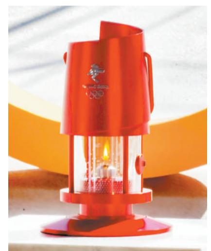
The kindling lamp of the Beijing 2022 Winter Olympics adopts the appearance of the Gilt Bronze Human-Shaped Lamp.

In order to solve these problems, team members utilized the double-layer structure and opened up space from top to bottom entirely so that when there is air pressure on the top of the lamp, the carbon dioxide exhaust in the chamber can be smoothly discharged from the sidewall space.