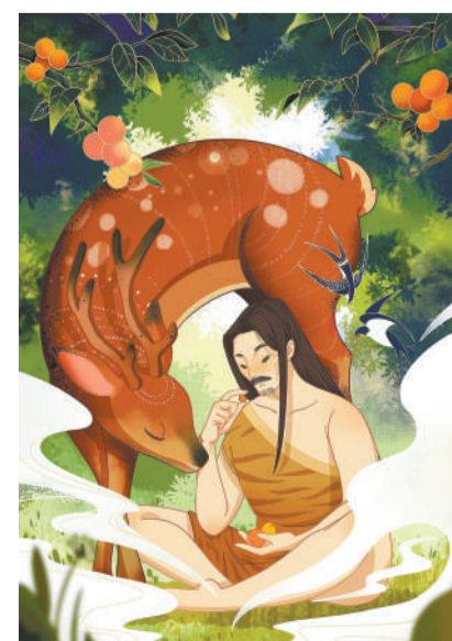
A creative picture of a legendary divine farmer: Shennong

Over the centuries, there have been many versions of the story of Shennong. However, by all accounts, because of his efforts, countless herbs are now used in traditional Chinese medicine and the importance of traditional herbs are now widely accepted.